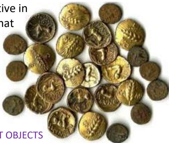
• ANCIENT OBJECTS

FIND OUT MORE about the Society's activities on our website at: www.bas1.org.uk