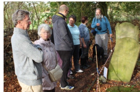
• LOCAL HISTORY