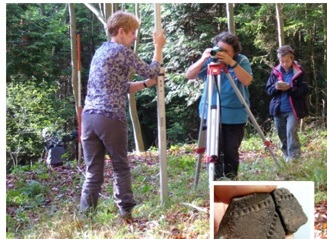
• ACTIVE ARCHAEOLOGY