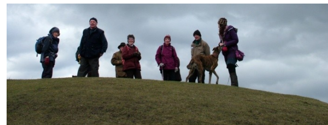
• HISTORIC LANDSCAPES