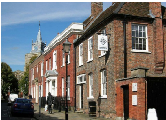
• HISTORIC BUILDINGS

OUR LIBRARY AT THE Discover Bucks Museum, Church Street, Aylesbury HP20 2QP is open Weds 10am-3pm